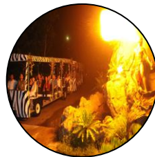
MALAYSIA (KUALA LUMPUR)